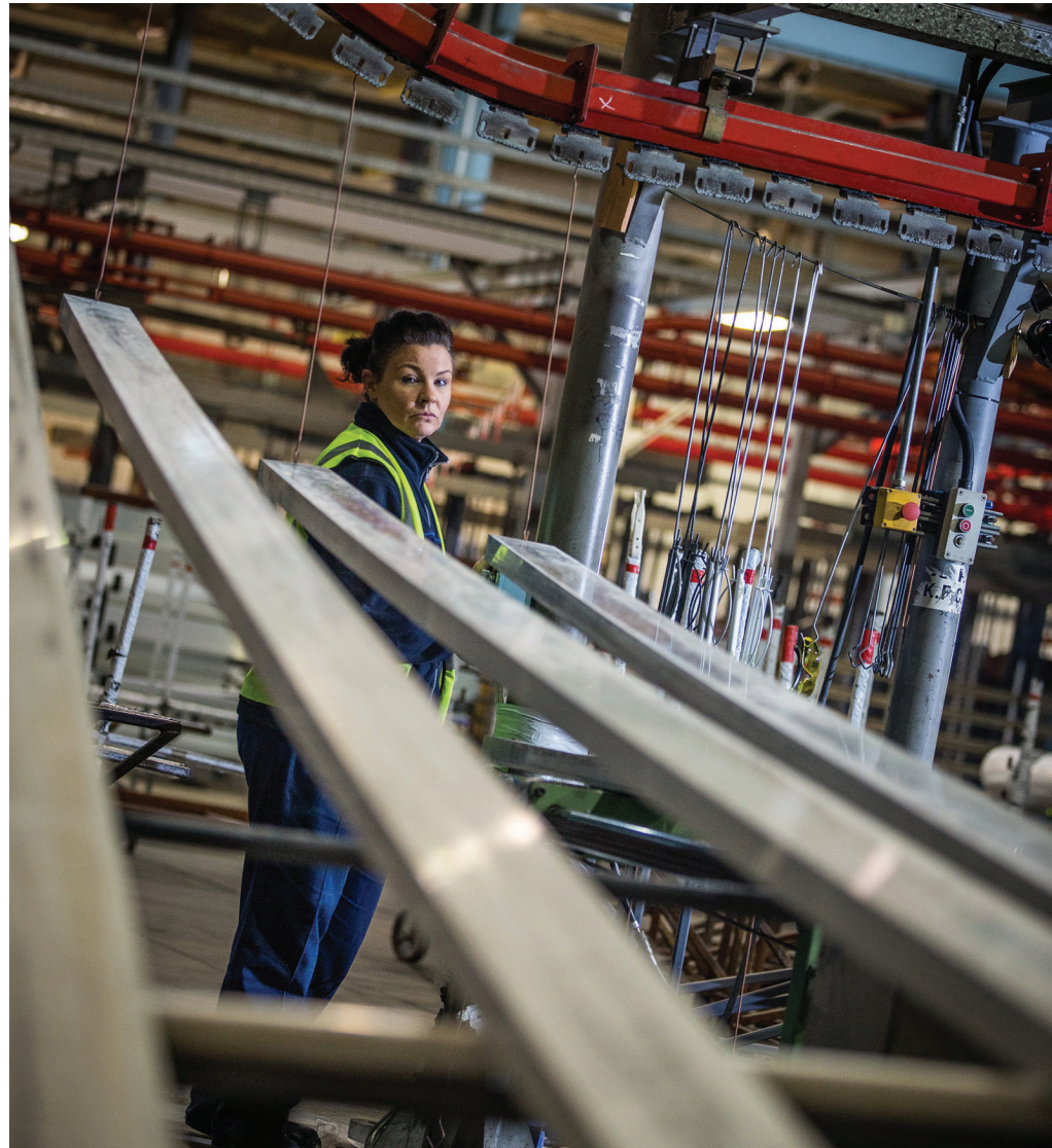
Above The powder-coating line is fully automated and used for large batches, going in gradually darkening colour runs through the spectrum, with a 40-minute cleaning process between each colour change.

That makes it the first company in the UK to provide a full fenestration service to its customers of aluminium system profiles, bespoke powder-coating and glazed units, all deliverable anywhere in the UK mainland. Senior prides itself on its willingness to take on projects of any size, specification and budget. Offering a full service package, it is able to remove uncertainty in the supply chain, and generate a five day turnaround of products delivered to the customer via its fleet of eco-vehicles, as well as offering a no-quibble guarantee with its powder-coating services.