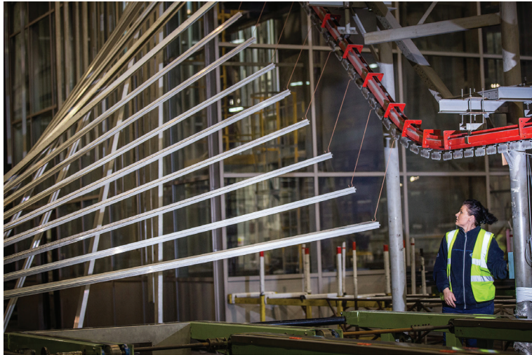
Left The automated vertical powder-coating line lifting the aluminium profile lengths through pre-treatment, powder-coating and baking processes.

Senior Architectural Systems' ability to match the latest technology with nurtured relationships and environmental responsibility has brought it to where it is today