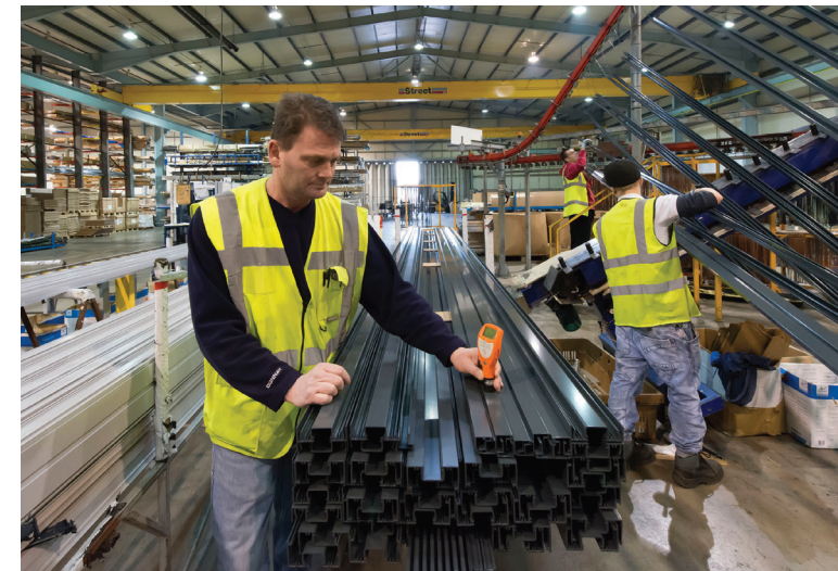
Below left Quality control processes include electronic monitoring to check coating thickness as well as visual checks for runs and inconsistencies.