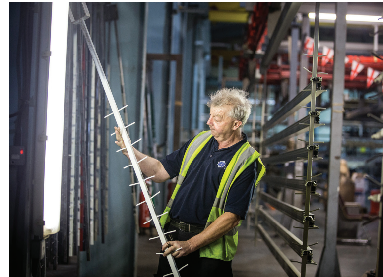
Left Horizontal hangers being made ready for the manual powder-coating line, which runs smaller batches and one-off replacements for larger batches.

Senior has always taken its environmental responsibilities seriously, manufacturing its profile systems from recycled aluminium and, with its 'Hybrid' range, timber from PEFC-certified European forests. For every tree it uses, four are planted to minimise environmental impact. Through careful specification of its products, Senior claims to be able to offer up to 40 of the 119 BREEAM credits available for new buildings, helping the industry to build better for the future. Sustainable sourcing and manufacturing is at its core and it is